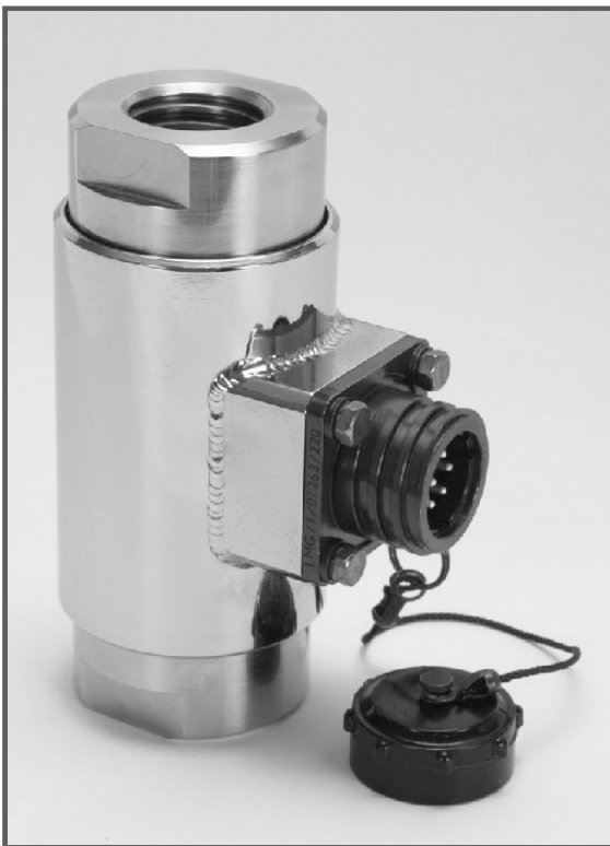
Note: Picture shows version with optional spanner flats